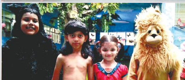
Jungle Book Characters by K. G. Students on the opening of "Play Area".