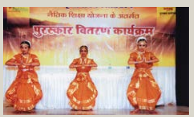
Extra Curricular Activities