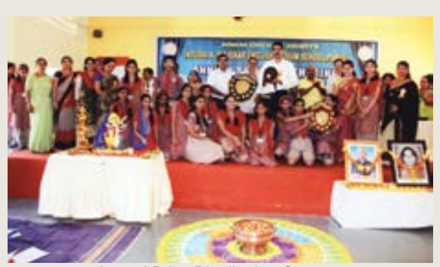
Annual Prize Distribution Ceremony