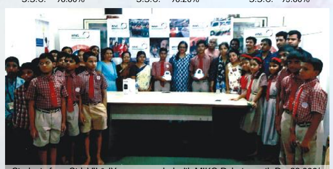
Students from Std. VII & IX were awarded with MIKO Robots worth Rs. 38.000/each for getting I & II position in interschool Science Exhibitionin Mumbai region orgnised by WNS core science center in June 2018