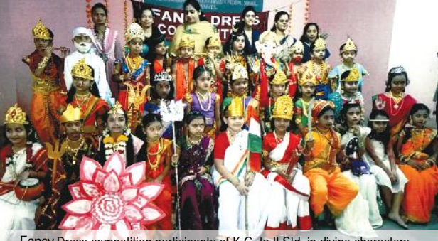
Fancy Dress competition participants of K.G. to II Std. in divine characters.